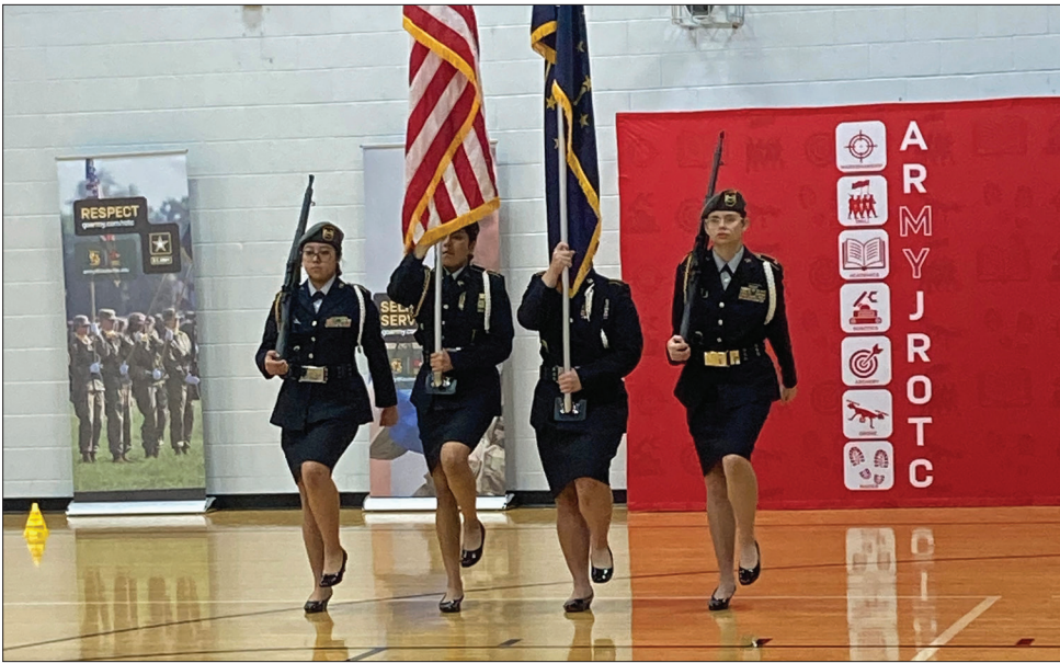
Marion High School's varsity JROTC color guard competed recently at the 7th Brigade Championship in Kentucky, earning second place from among the best teams from Michigan, Kentucky, Ohio, Tennessee and Indiana. This was the highest finish ever for a Marion drill team competing at this level.

The JROTC Dept. is accepting donations to help with the expenses associated with this trip. Donations can be mailed to Marion High School, 750 W. 26th St., Marion, IN 46953, or made online: https://bit.ly/GiveToMHSJROTC