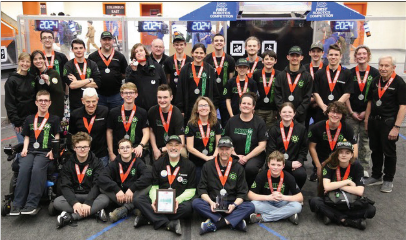
Team receives Engineering Inspiration Award

we treat people like people. because, they're people. simple human sense