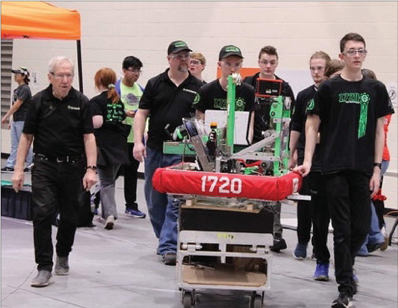
Getting ready to take to the field.